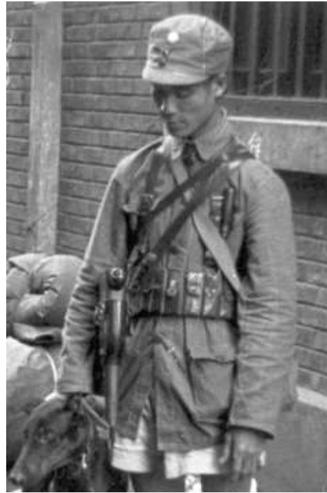
Left – Chinese soldier at the battle of Wuhan in 1938 with stocked C96. Right – Warlord soldier with a C96 holstered in its wooden stock.