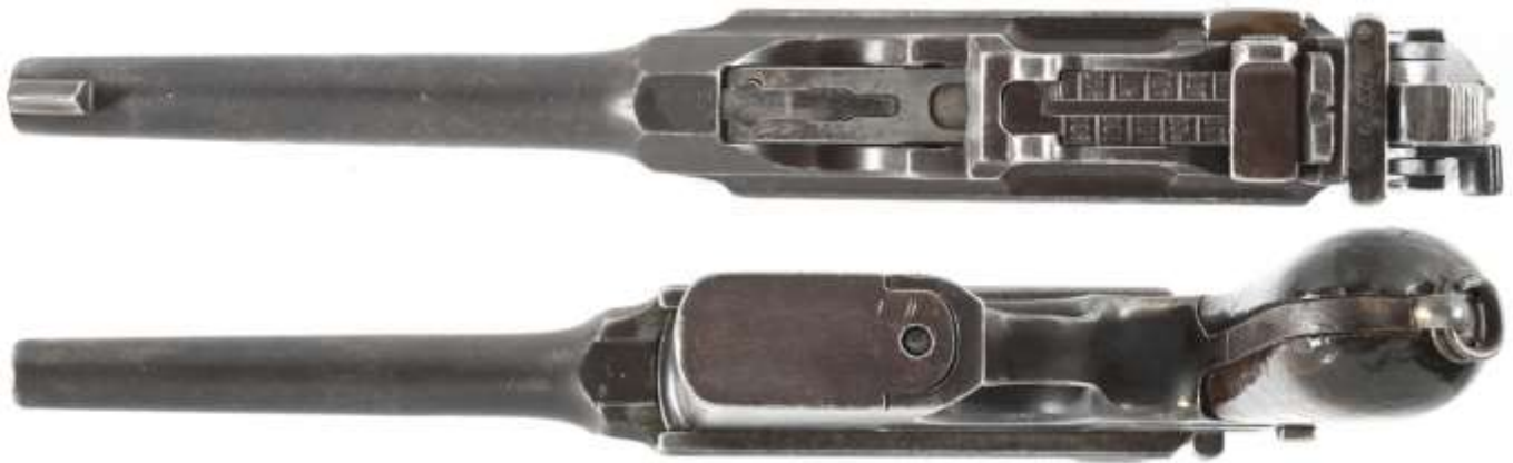
Top and bottom views of a Type 17 .45 caliber pistol. It is wider than the C96 in 7.63mm in order to accommodate the larger .45 caliber ammunition..

Besides being chambered for a larger .45 caliber cartridge, the frame of the Type 17 pistol was larger than the 7.63mm C96 models, with the 10-round box magazine extending below the trigger guard. Although some of the overall length and grip frame dimensions are similar, the .45 caliber Type 17 is substantially wider than the 7.63mm C96. Two five-round stripper clips were used to load the Type 17 rather than the single 10-round stripper clip of the standard 7.63mm C96 Mauser. Because of the overall increase in size, Type 17 pistols share no interchangeable parts with any other C96 variant. They are 11.73 inches (29.8cm) long with a 5.5 inch (14cm) long barrel. They weigh 3.66 pounds (1.66kg) without the shoulder stock and 5.3 pounds (2.4kg) with the shoulder stock. The v-notch, adjustable rear sight is graduated to 1,000 meters. The hard wooden grips are usually grooved (although plain grips are not unknown) and often have 14 horizontal grooves. Almost all grips are oil stained.