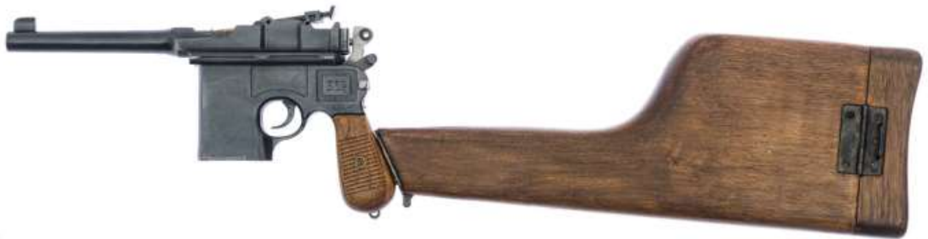
Chinese Type 17 pistol-carbine with detachable wood stock/holster. Made by Yan Xishan's Taiyuan Arsenal in Shanxi Province.