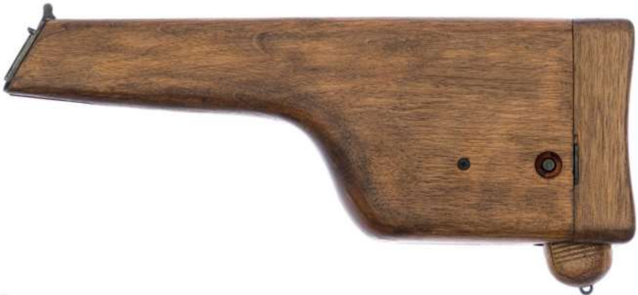
Shanxi Type 17 pistol inside its detachable wooden shoulder stock and holster. New holster/shoulder stocks were made to fit the Type 17's larger dimensions.

1931.) In 1936 and 1937, several years after production of the Type 17 ended, the Taiyuan Arsenal assembled a limited number of C96 pistols in 7.63 mm. Most were of standard dimensions and configuration although a few were selective-fire.