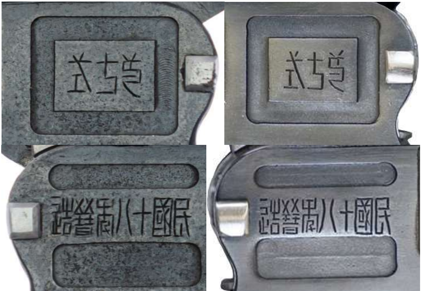
Left – Genuine original roll die inscriptions. Right – Reproduction pantograph inscription.

included the sale of firearms (remember all the inexpensive Chinese SKS's at gun shows?) Thousands of the remaining warlord pistols, particularly C96s, were imported into the United States by Navy Arms and other importers. Collector demand in the United States for Taiyuan Arsenal .45 ACP Type 17 pistols had driven prices to unprecedented levels. Perceiving the potential for easy profits from gullible Americans, Chinese businessmen reproduced the Type 17 with markings patterned after the late production Type 17s. The new-built guns were introduced as “refinished originals” for $2,000-$2,500, allegedly selected to have excellent bores and with replaced parts. After the fraud was discovered, the prices of the “modern” Type-17's dropped in half. However, the fraudsters were not done. In order to increase interest and mislead the still-naïve, some of the guns were distressed to make them appear worn and aged. The antiquing was performed very skillfully. However, there are still ways to determine if a Type 17 is original or a skillful modern reproduction. One of the best clues to determining if a Type 17 is a genuine original is to carefully examine the panel markings.