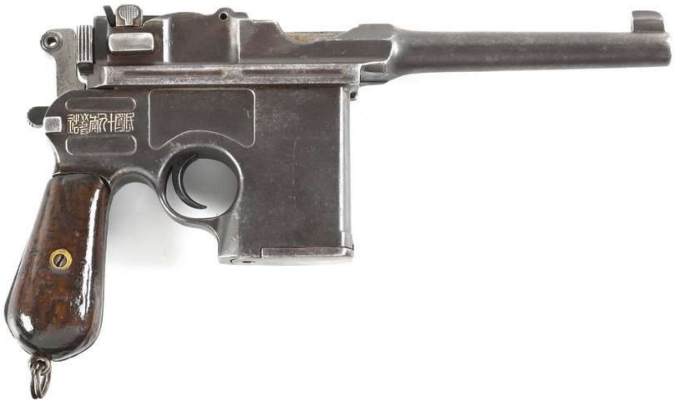
Shanxi Type 17 pistol. The markings on the right-side panel give appear to read that it was manufactured in the year 19, which indicates that it was made in 1931 or 1932 (19 years after the revolution in 1911). Note the smooth wooden grips.