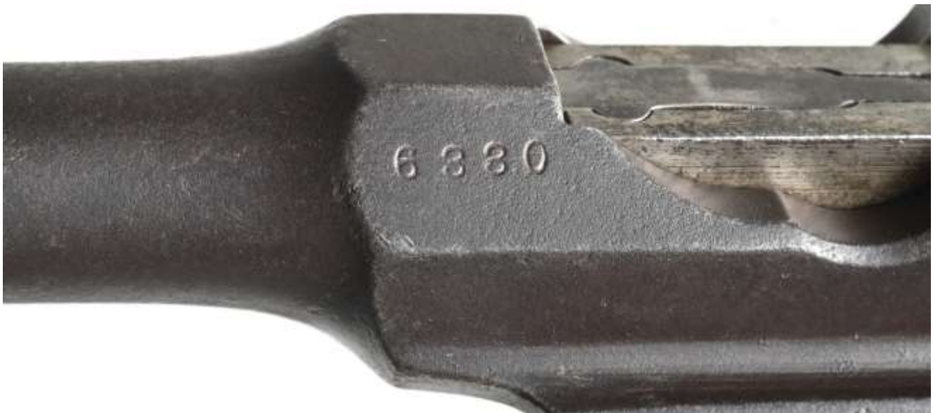
Type 17 serial number on the left chamber flat.

Besides being chambered for a larger .45 caliber cartridge, the frame of the Type 17 pistol was larger than the 7.63mm C96 models, with the 10-round box magazine extending below the trigger guard. Although some of the overall length and grip frame dimensions are similar, the .45 caliber Type 17 is substantially wider than the 7.63mm C96. Two five-round stripper clips were used to load the Type 17 rather than the single 10-round stripper clip of the standard 7.63mm C96 Mauser. Because of the overall increase in size, Type 17 pistols share no interchangeable parts with any other C96 variant. They are 11.73 inches (29.8cm) long with a 5.5 inch (14cm) long barrel. They weigh 3.66 pounds (1.66kg) without the shoulder stock and 5.3 pounds (2.4kg) with the shoulder stock. The v-notch, adjustable rear sight is graduated to 1,000 meters. The hard wooden grips are usually grooved (although plain grips are not unknown) and often have 14 horizontal grooves. Almost all grips are oil stained.