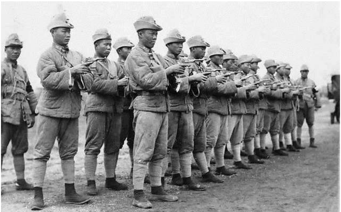
Warlord Sun Chuanfang's Anguojun soldiers drilling with Mauser pistols, 1926-1928.