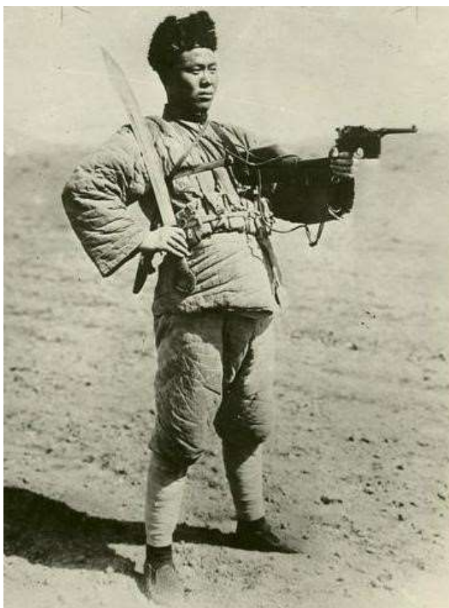
Photo left - Chinese warlord soldier with Mauser C96 pistol and Dadao sword. Public Domain.

The Mauser C96 ( Konstruktion 96 ) is a semi-automatic pistol that was originally produced by German arms manufacturer Mauser from 1896 to 1937. It was the first self-loading pistol to be industrially produced in large numbers before 1900. The distinctive characteristics of the C96 are the integral box magazine in front of the trigger, the long barrel, the wooden shoulder stock, which gives it the stability of a short-barreled rifle and doubles as a holster or carrying case, and a grip shaped like the handle of a broom. The gun was nicknamed "broomhandle" in English because of its grip looked like the handle of a broom, and in China the C96 was nicknamed the "box cannon" because of its rectangular internal magazine and because it could be holstered in its wooden box-like detachable stock.