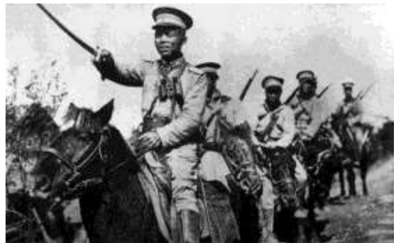
Photo right - Chinese Warlord cavalry.