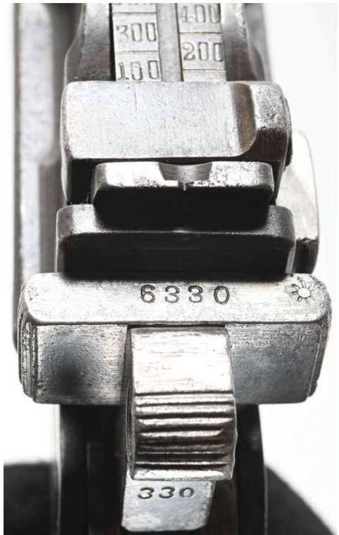
Photo Above Left - Type 17 serial numbers on the back of the hammer, back of the sub-frame and top of the backstrap.