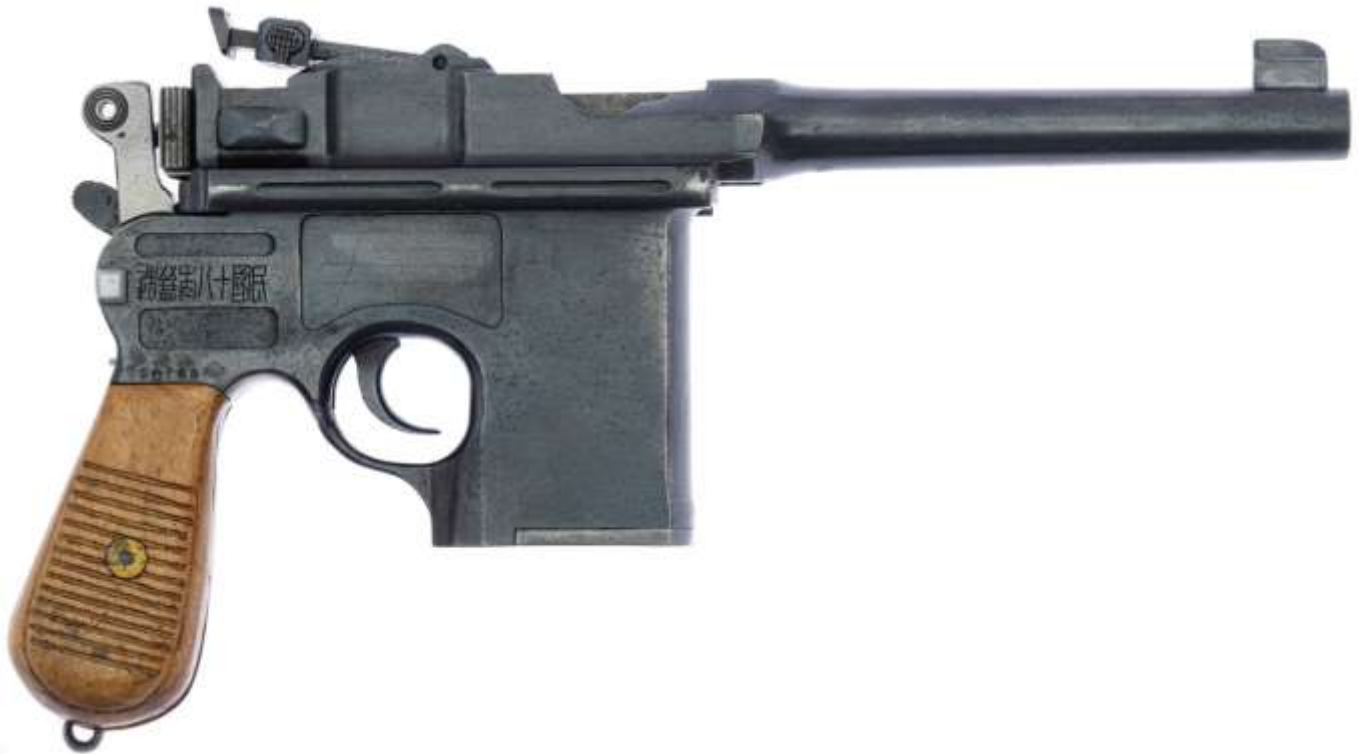
Photos above and below. Right and left sides of .45 caliber Shanxi Type 17 pistol. Note how the magazine extends well below the triggerguard in order to accommodate the larger .45 cartridges.

larger Zhuan Xu font characters. Frames were marked in that manner until the 8000 serial range, which was reached in 1931. Subsequently assembled guns had only the Type 17 designation on the left side panel.