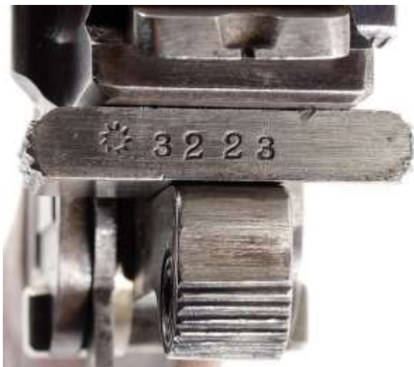
Photo Left - Type 17 serial number on the top of the bolt. Note that the 12-pointed star associated with the Chinese Republic of the 1920's is to the left of the serial number.

The communists destroyed most of the Type 17 Shanxi .45 pistols after their victory over the Nationalist Government in the Chinese Civil War. It has been surmised that the destruction was largely due to their odd caliber which did not conform to Chinese communist standards. However, a few examples were put in storage and later exported overseas for sale on the commercial market.