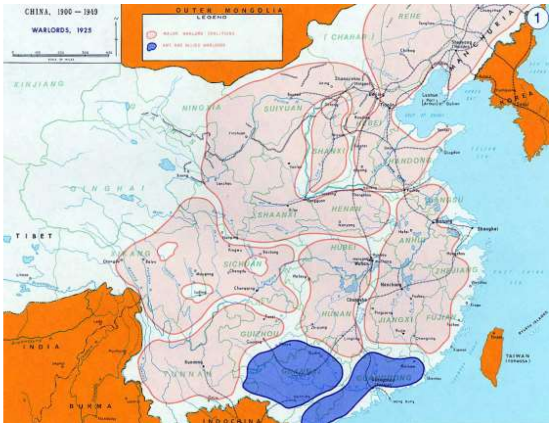
Map of the various Warlord faction areas in the late 1920's. Shanxi province is west of Henan in the approximate middle of the map. Map from US Military Academy, West Point, Public Domain.

The Chinese Warlord Era began started (depending on source) in 1911 or 1912 (end of the Qing Dynasty) or 1916 (the death of Yuan Shikai). The country was divided and ruled by various military Warlord factions and cliques. Communist revolution broke out in the later part of the warlord period, beginning the Chinese Civil War. Although the era nominally ended in 1928 at the conclusion of the Northern Expedition, warlords such as Yan Xishan continued to exist and prosper into the 1930s and 1940s under tenuous Kuomintang rule, and were often a potent force until the final Communist victory in 1949.