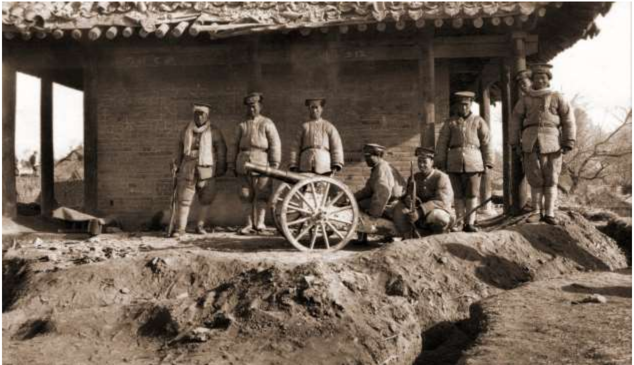
Yan Xishan's soldiers in Liaozhou in 1925 during the war with the Henan warlord Fan Zhongxiu.

resumed control of Shanxi, cooperated with the Communists against the Japanese when they invaded China, and after the Japan's defeat enlisted stranded Japanese troops to help him fight against the Communists during the Chinese Civil War. Shanxi was lost to the Communists and after the war he fled to Taiwan and served as Premier until 1950 when Chiang Kai-Shek re-assumed the Presidency.