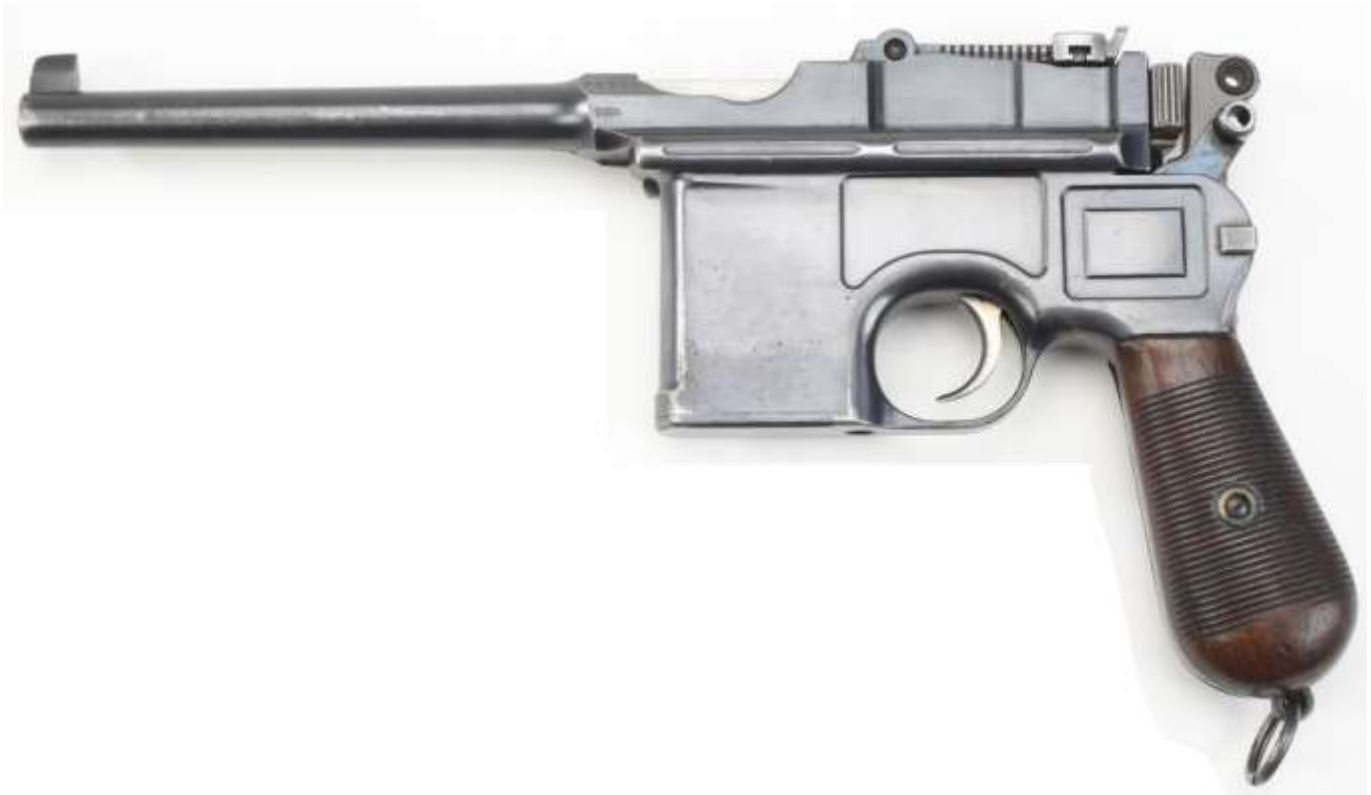
Mauser C96 Export Model, 7.63mm.

The “Box Cannon” C96 was one of the most common and popular pistols in China during the Warlord period which, depending on the source, started in 1911 or 1912 (end of the Qing Dynasty) or 1916 (the death of Yuan Shikai) and ended with Chiang Kai-Shek's exile to Taiwan in 1949 when the Communists took over. It was a time of over 30 years of near continuous civil war with numerous provincial warlords (called junfa in Chinese) fighting each other, the nationalist Kuomintang government and the communists (and then the invading Japanese) in an ever shifting kaleidoscope of temporary alliances and battles. Many of the warlords built up vast armies in their continuous efforts to control one of the world's largest countries. Everyone – warlords, government, rebels, secret societies and communists – needed lots of guns and needed them quickly.