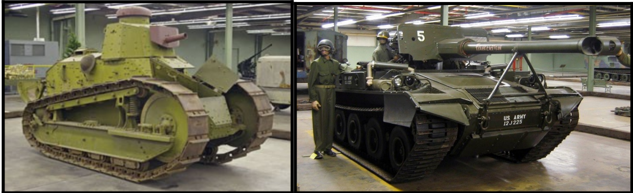
Left - M1917 Special Tank. Right - M56 Scorpion Airmobile Self Propelled 90mm Anti-Tank Gun

The many other collections of military artifacts are displayed in another part of the museum with more traditional size rooms and galleries. There are three rooms that display the firearms collection. Although these collections are behind Plexiglas they are impressive in scope and number of items. The first room is about 16' x 16' and three of the walls are completely covered with over 80 neatly hung military rifles from the World Wars forward. The second display is in a large room, one wall of which is covered with numerous sub-machine guns from around the world and various other weapons. The third display room is considerably larger than the first, about 25' x 25', and the floor and three walls are filled with well over 150 Class III weapons ( see photo above ). Just about any machine gun you could name is in that room in addition to many mortars and anti-tank weapons (including a Russian Sagger ATGW) and an early cannon from medieval times. Collectively, there are about 187 Class III weapons in the museum. Unfortunately, in the larger rooms some of the weapons are far from the viewer and the lighting and signage could also be improved.