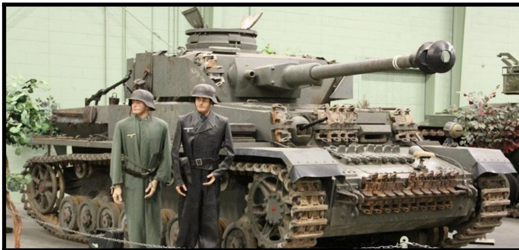
German Panzer IV Display above.

The heart of the museum are the three large tank galleries that contain most of the vehicles. They showcase a superb collection of over 120 tracked or wheeled pieces of equipment that range from the earliest through the Iraq War. The vast majority of vehicles were used by the United States, but there are a few foreign armored fighting vehicles (AFVs). Some of the U.S. tanks are very rare, such as, an M-1917 "Special Tank," the first American tank produced, an M4 Sherman with a bulldozer blade, and an M-103A2 Heavy Tank with its 120mm main gun that was developed during the Cold War to counter Soviet heavy tanks. They also have armored personnel carriers, armored cars, half-tracks, scout cars and a number of all-wheel-drive support vehicles. Also on display are a large number of artillery pieces and other equipment.