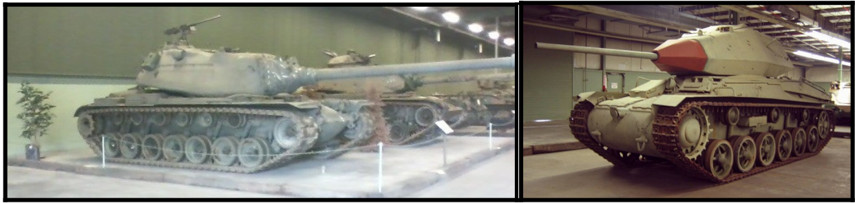
Left - US M103A2 Heavy Tank. Right - Swedish STRV74 Tank.