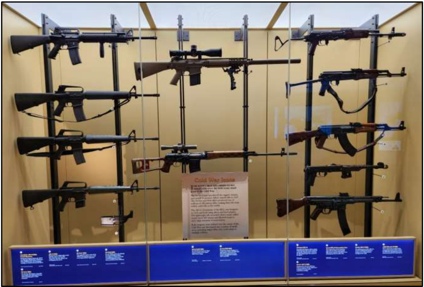
This display of U.S. M16s and Eastern Bloc AK family of small arms of the Cold War ( above ) was a “crowd pleaser.” Included was the M110 Semi-Automatic Sniper System (SASS) chambered in 7.62x51 NATO ( center top ) and the Soviet Dragunov SVD in 7.62x54R ( center bottom ).