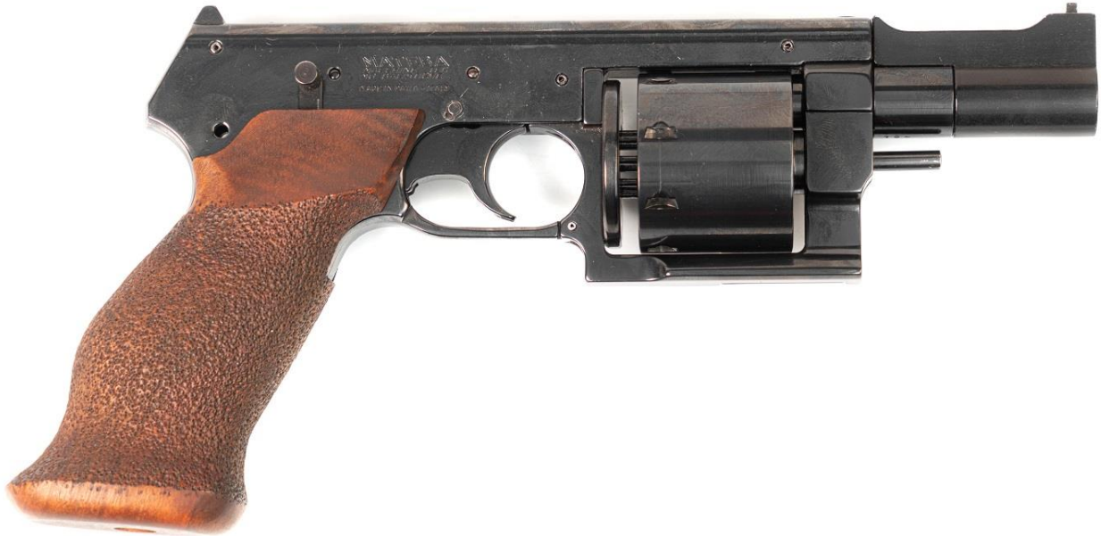
Mateba MTR-8 revolver. Right side.

Ghisoni also used a larger, higher capacity cylinder, which added to the forward weight and also reduced perceived recoil. The MTR-8 cylinder contained 8 rounds of .357 or .38 caliber ammunition, the MTR-12 cylinder held 12 rounds of .32 caliber ammunition, and the MTR-14 cylinder chambered 14 rounds of .22LR. The cylinder swings out to the left for reloading, the cylinder release latch is located at the front of the cylinder on the cylinder crane, and the cylinder is opened by pushing down on the latch.