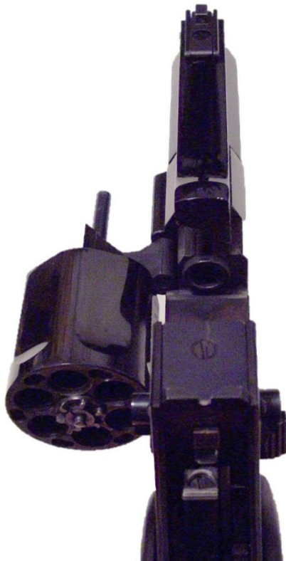
Photo left. Mateba Model 6 Unica, top and rear view. Note absence of a top strap connecting the barrel with the rear frame. Also note low position of the barrel and the flat sided cylinder.

The barrel follows Ghisoni's trademark design principal and the bore is aligned with the bottom chamber of the cylinder in order to direct the recoil directly back to the shooter's arm and minimize muzzle flip and perceived recoil. The gun's entire upper assembly consists of the barrel, cylinder and frame. It is mounted on rails that are machined on the lower frame, which houses the trigger, hammer, and grip. The upper assembly recoils backward when the pistol is fired and the rearward motion cocks the hammer. The cylinder is rotated into battery on the forward stroke of the upper assembly.