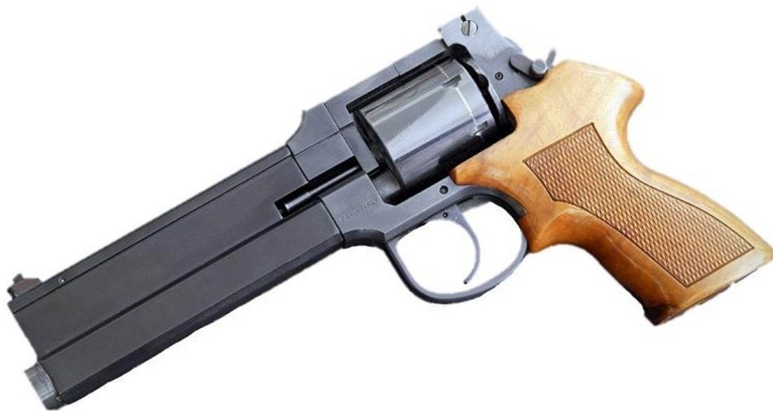
Mateba 2006M.