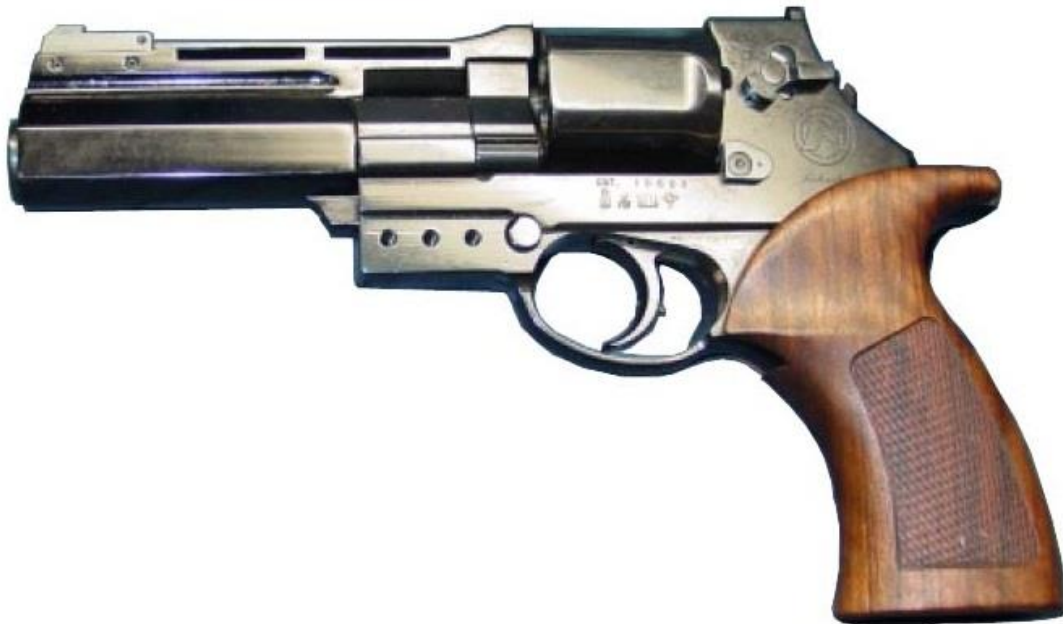
Mateba Model 6 Unica Autorevolver.