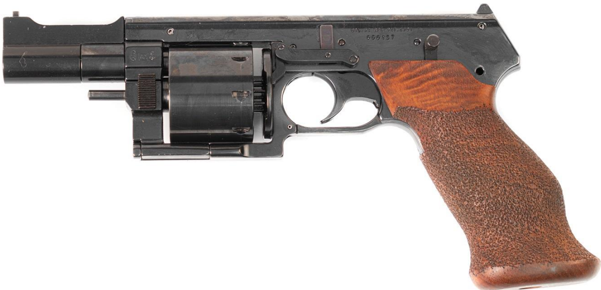
Mateba MTR-8 revolver. Left side. Note cylinder latch on the cylinder crane in front of the cylinder.