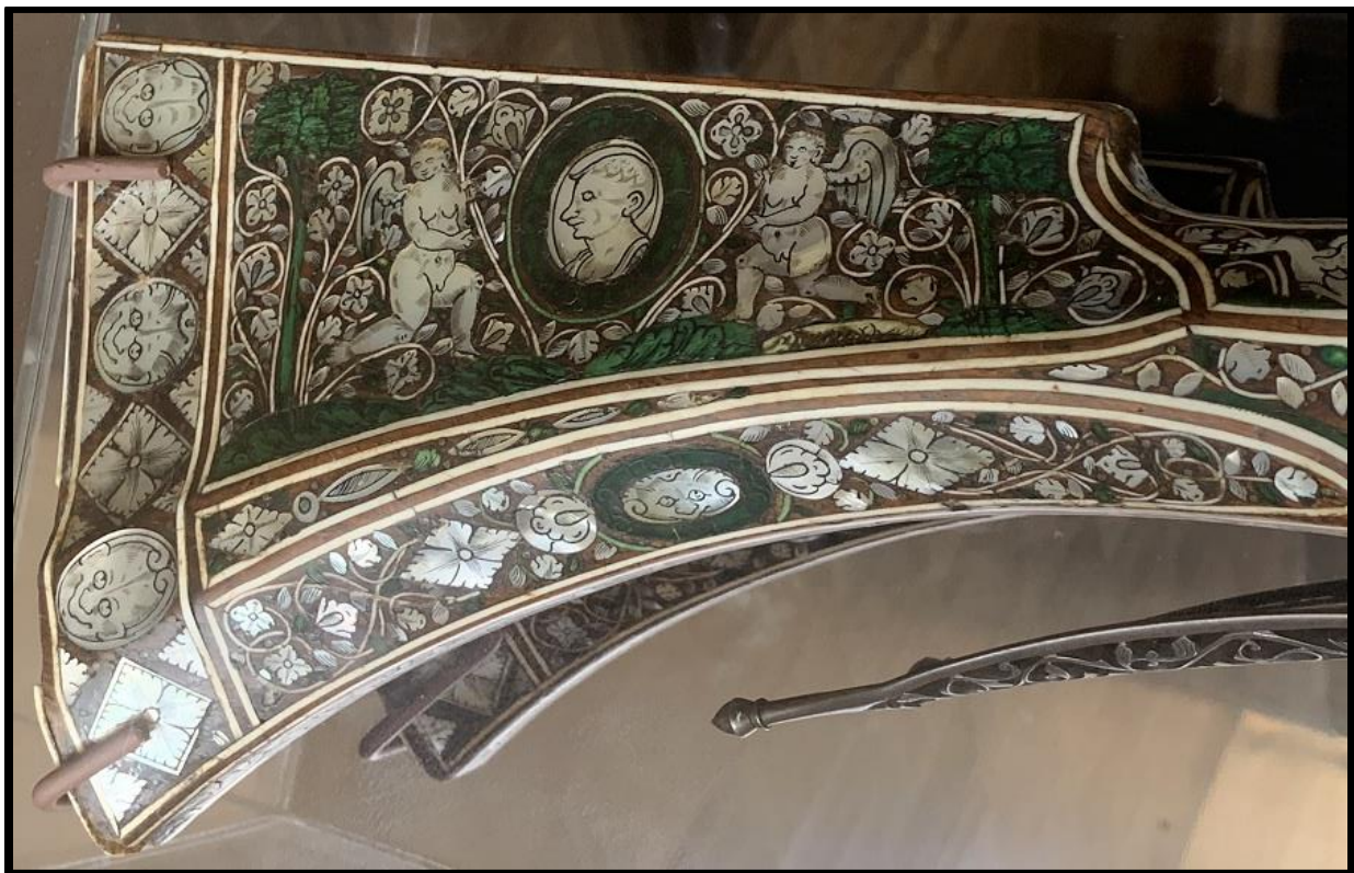
Close-up of the butt of an Italian matchlock musket. The stock is sheathed in plates of mother-of-pearl and green ivory engraved in different scenes, armorial bearings and conventional floral design devices. Although each area is a separate composition they comprise an elaborate unified whole.

For additional information, call (304) 529-2701 or visit the museum website at https://www.hmoa.org/ .