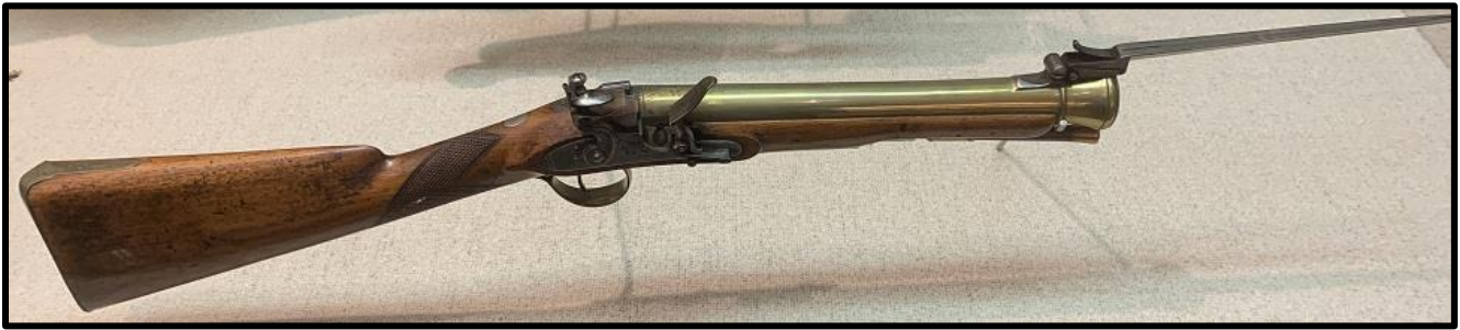
Henry Nock Coaching Blunderbuss with spring bayonet, 1741-1804.

The Huntington Museum of Art is located at 2033 McCoy Road, Huntington, WV 25701. It is open Tuesday through Sunday: