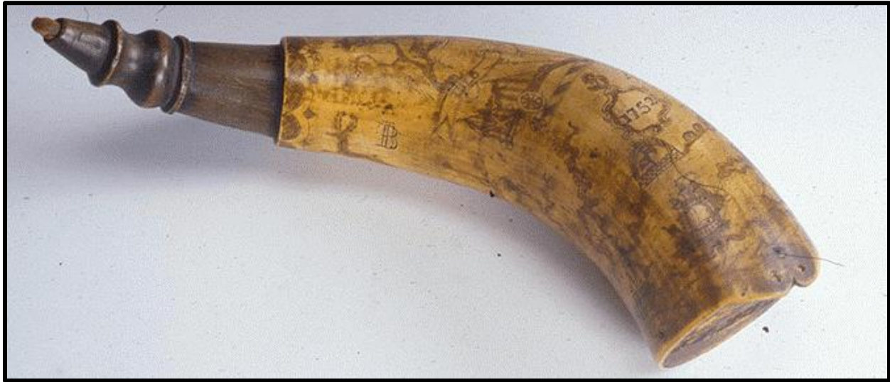
Powder Horn, 1760.

The collection also has a special regional focus on the evolution of the Pennsylvania long rifle carried west to Kentucky and beyond, and contains some of the finest surviving examples. Two historically significant examples are attributed to famous American frontiersmen Simon Kenton and Daniel Boone. The exhibit of carved and engraved powder horns contains beautiful pieces that are true American works of art.