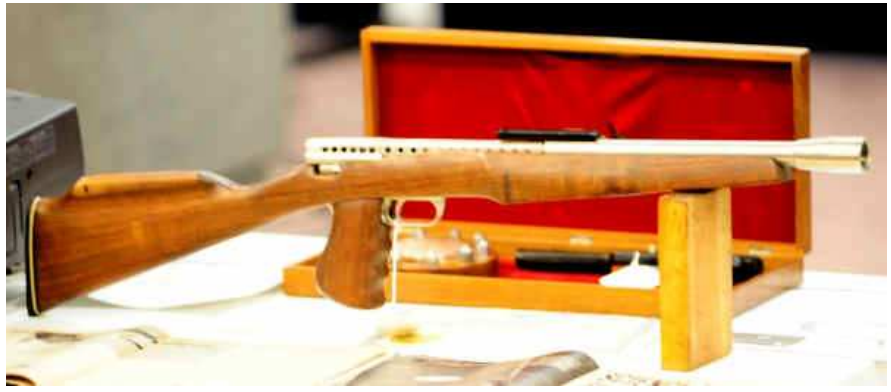
R: Ernie Lyles Gyrojet Carbine in front and cased presentation Gyrojet pistol and case behind.