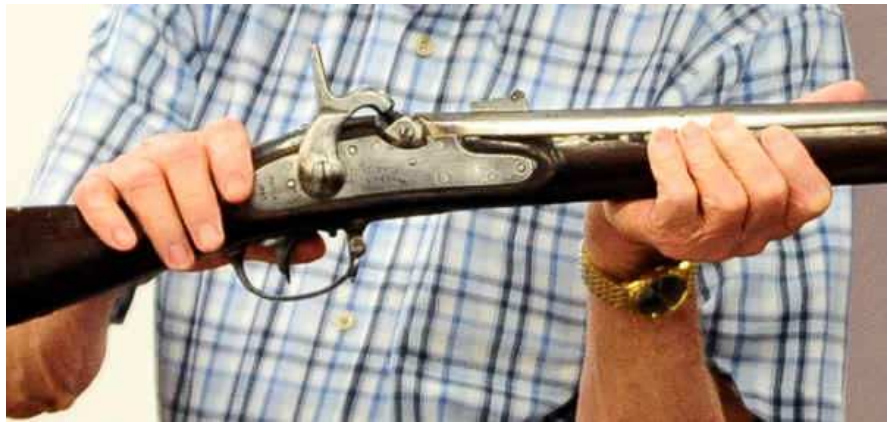
Upper L: Sonny Laine displays his USMC Civil War sword. Upper R: Lock detail of Ben Simms 1816 Springfield Wickham conversion.