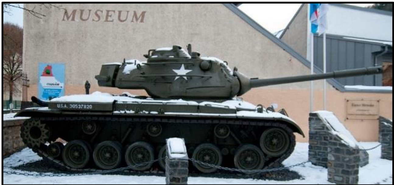
Mussee National D’Histoire Militaire

One of the most unique military history museums is located in a small town that found itself between the advancing allied army and German troops defending the German homeland. The museum is the Mussee National D’Histoire Militaire in Diekirch, Luxembourg. The town of Diekirch is located approximately 35 km northeast of Luxembourg City. The unimposing exterior of the museum belies the military treasures that are contained inside. The museum is mostly dedicated to World War II and specifically the battles that were fought in the winter of 1944/45. The museum also serves as the military history museum of the country Luxemburg from the early 1900’s to the present. The museum is home to one of the most dramatic and complete collections of World War II small arms and equipment in the world.