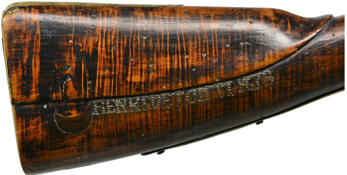
Right side of buttstock. Tacks read "HENRI DE TONTI 1678."

What ties this gun to Henri de Tonti is his name, and the date 1678, that are written in tacks on the right side of the butt stock. Tonti sailed to New France with La Salle in 1678. It is quite conceivable that he obtained this carbine in Italy and took it with him when accompanied La Salle.