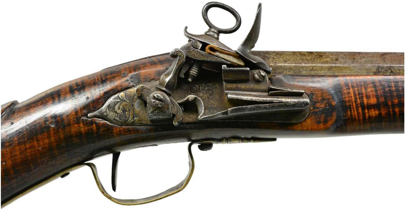
Italian form of miquelet lock of Henri de Tonti's carbine.

What ties this gun to Henri de Tonti is his name, and the date 1678, that are written in tacks on the right side of the butt stock. Tonti sailed to New France with La Salle in 1678. It is quite conceivable that he obtained this carbine in Italy and took it with him when accompanied La Salle.