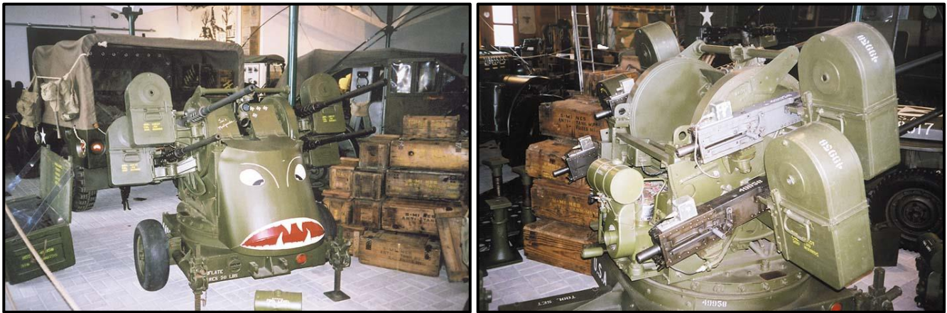
US Quad .50 caliber AA trailer mount, front and side.

On the German side there is a 2 cm (20mm) four barreled Flakvierling German anti aircraft gun in perfect condition. Next to the Flakvierling there is a Jagdpanzer model 38(t). An American M-3A1 Halftrack sits in one corner bristling with two 1919A-4 machine guns on flex mounts and a M-2 "Ma Deuce" on the ring turret. Of particular interest was a mint condition M-55 Quad .50 Caliber Anti Aircraft trailer being towed by a 3/4 ton Dodge 4x4. The M-55 sported a red and white shark's mouth on the front shroud, most assuredly a GI field modification.