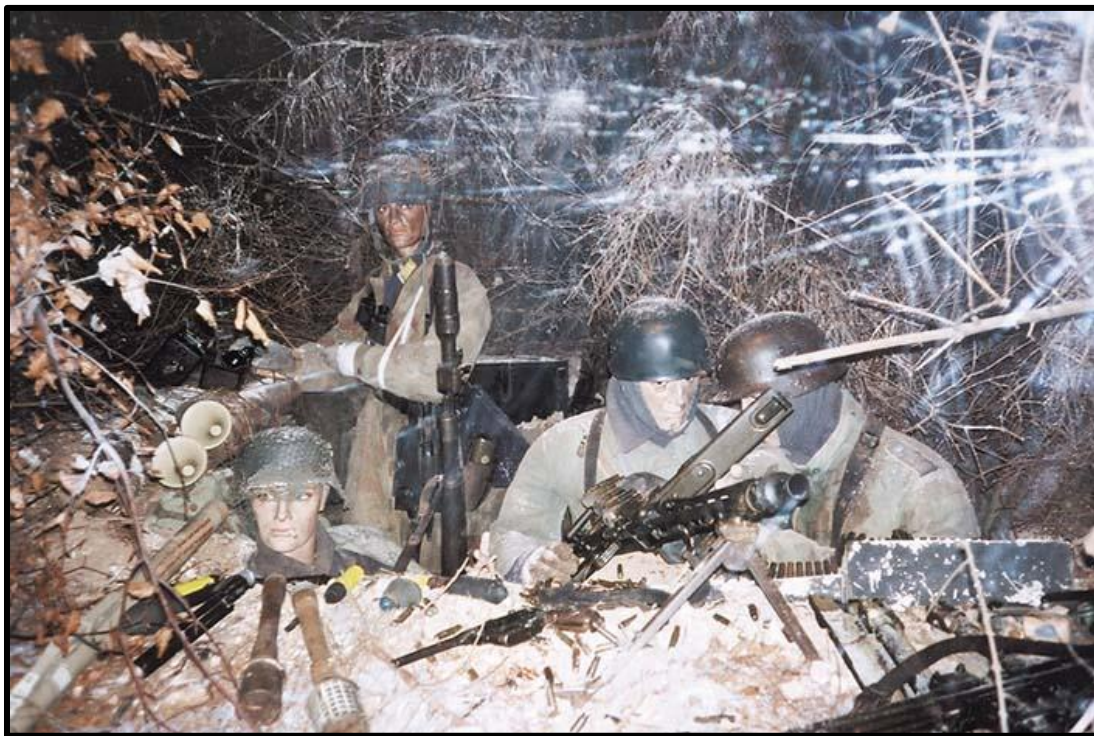
Diorama of German MG 42 machine gun nest.

scene has amazing detail from the German mailbag to the spilled food down the side of the meal wagon. Several other scenes depict a German MG 42 machine gun nest, a US mortar crew using a building as firing position, a German PAK 40 cannon with crew and German 8 cm mortar crew. One diorama has a German communication NCO maintaining listening watch inside of a farmhouse serving as a command post. Several German soldiers have sought refuge in the house. Inside the house there are fine examples of the MP 44 series and the MG 42. At each display there are literally hundreds of genuine artifacts that have been assembled to provide realism and authenticity.