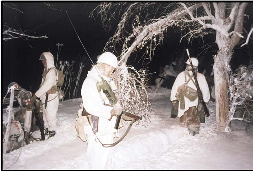
Large diorama (top and at right) of troops of the US 5 th Infantry Division conducting a nighttime crossing of the Sauer river at Diekirch on January 18, 1945.

After leaving the weapons collection room, the museum journey will now take you through snap shots of the war in the winter of 1944/45. These snap shots are in the form of life sized dioramas depicting soldiers at war. The largest of these displays depicts elements of the Fifth US Army making a night crossing of the Sauer River into Germany on January 18, 1945. The Platoon sized scene has US soldiers dragging aluminum boats in deep snow to the river's edge. The depiction puts you at the rear of the column as they advance into a dark snowy horizon. Each of the soldiers are wearing white snow smocks and are carrying a variety of weapons from the Browning 1919A-4 to the M-1 Rifle. Nothing has been left to imagination. The scene has been recreated to give the viewer a very accurate depiction of the event.