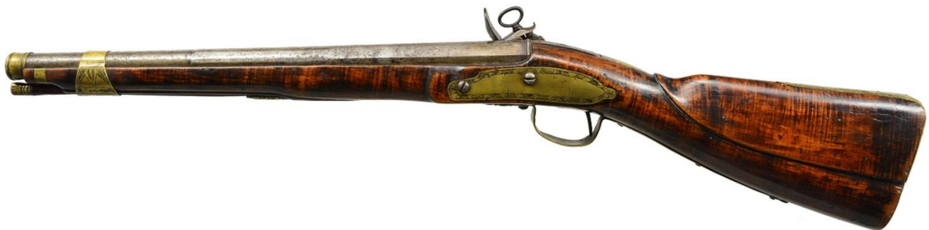
Tonti's miquelet carbine.