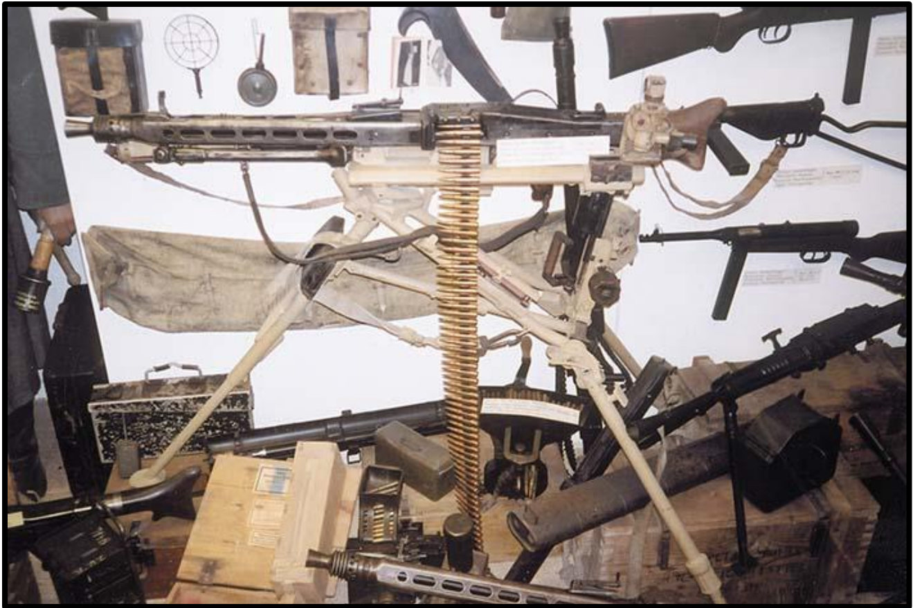
MG 42 in the weapons exhibit.

Literally every square inch on the bottom of the display case is occupied by a machine gun or associated accessories. A well worn MG 08 and its cousin the MG 08/15 are present. Several MG 34's and the revolutionary MG 42 machine guns are on display. As you go through the museum there are probably at least 10 more examples of each the MG 34/MG 42. A Czech ZB -30 that does not have German acceptance markings fills the front of the case. The ZB-30 does have a rather unusual feature, the magazine of the weapon has two magazines seam welded together to increase capacity. The ZB-30 was known in German nomenclature as the Maschinengewehr (30) t and was the only true light machine used by the Germans during the war. Another weapon of Czech origin is the ZB 37 (Model 37) Heavy Machine Gun in 7.92mm. The ZB 37 was used mostly as vehicle armament due to its size and weight. Other captured/nationalized non-German manufactured weapons include the French model 1924 M29 Chatterault, an 8mm Madsen 08 as well as the Austrian Schwarzlose.