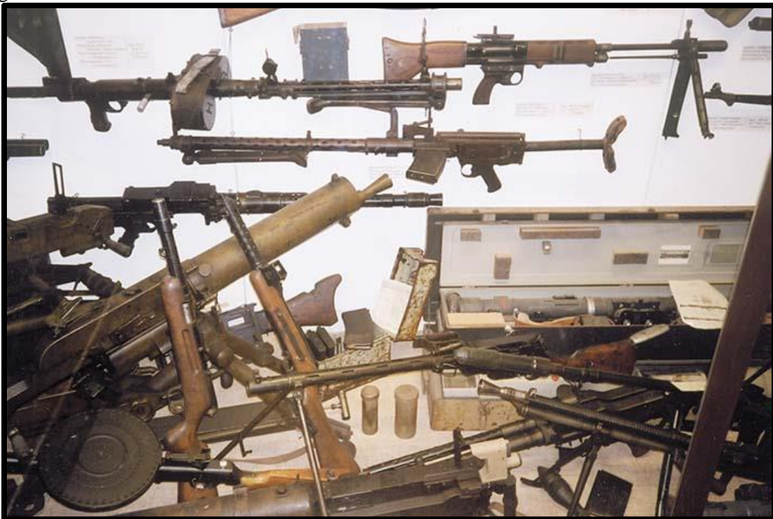
Part of the German machine gun display in the weapons collection room.

One of the first stops is the weapons collection room. As you enter, the archway over the door has the rusted relics of an M-1 rifle, Kar 43 and an MP-44 standing guard over the collection. Once inside you are overwhelmed by the enormous collection of weapons, ammo and armaments that are on display. The first case contains a complete assortment of German weapons used in WW II. There are three variations of the German Strumgewehr. The MP-43, MP-43-1 and the MP-44 with accessories such as the magazine loading tool and MP 44 leather magazine pouches. A Third Production model FG-42 (G) in excellent condition is also on display. The collection includes virtually all of the German sub machine guns used in WW II. The examples include the MP 38, MP 40, Erma EMP, Austrian made Steyr Solothurn MP 34(O) model, Bergman MP 35 and a Schmeisser MP28II. Italian submachine guns are present in a Beretta Model 38A and a Beretta Model 38/42 that was favored by some German units. The museum unfortunately did not have examples of the German STEN copy, the MP 3008 or the very crudely manufactured Erma EMP 44. German battle rifles include most variations of the Gewehr 98, 98A and 98K in both standard and sniper variants. The semi-automatic Kar 43 and G43 sniper variant as well as the G 41 are present. The best part of this display is the assortment and variations of German machine guns.