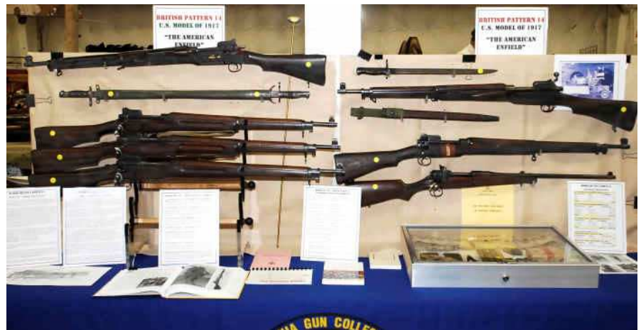
First Place: Marc Gorelick's display of "The American Enfield - US Rifle Model of 1917 and British Pattern 14"