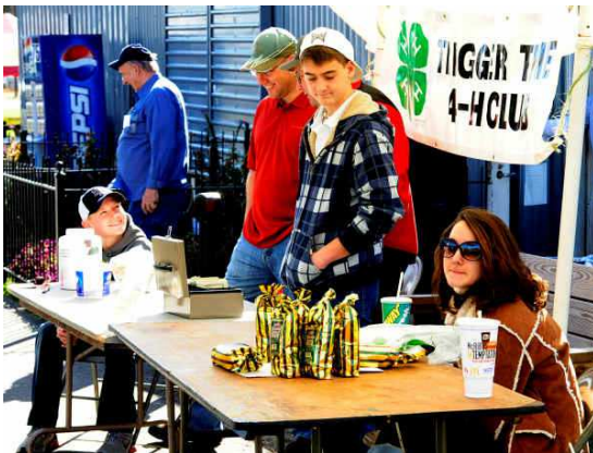
L & R: Thanks to Trigger Time for Gate and Cleanup duties.

NOTE: Due to the size of the displays, the photos shown have been cropped to preserve detail. They do not show all the examples present in each display.