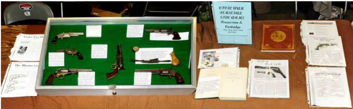
L: John Babey's Civil War themed display had percussion and cartridge revolvers and selected accoutrements and documentation.